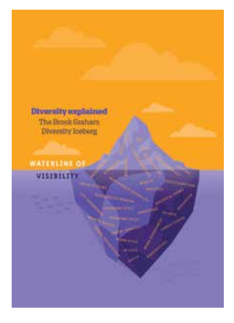
The Brook Graham diversity iceberg water line of visibility

Our individual experiences, backgrounds, traits, and preferences [our 'iceberg'] create the lens through which we see the world. Each iceberg is unique. Therefore, we see the world as we see it not as it is.