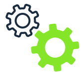
Science & Engineering