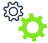
Science & Engineering